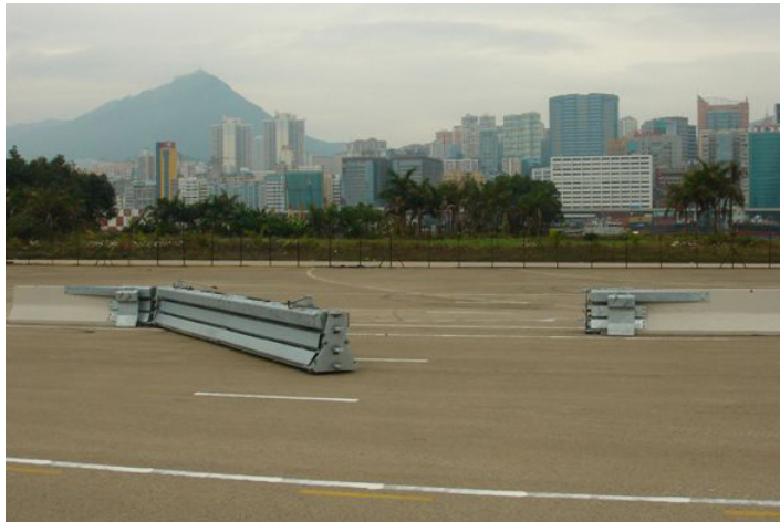
The ArmorGuard Gate System is easy to operate using a simple four-step process to open/close the gate.