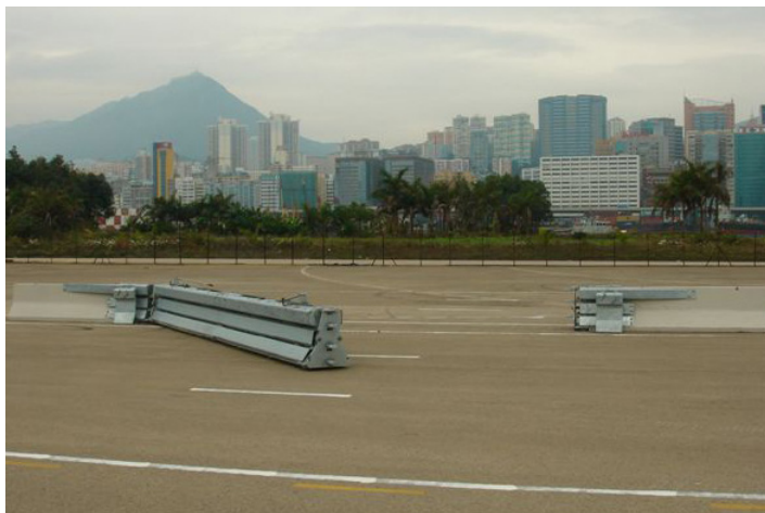
The ArmorGuard Gate System is easy to operate using a simple four-step process to open/close the gate.